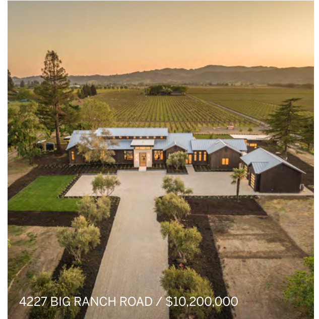
4227 BIG RANCH ROAD / $10,200,000