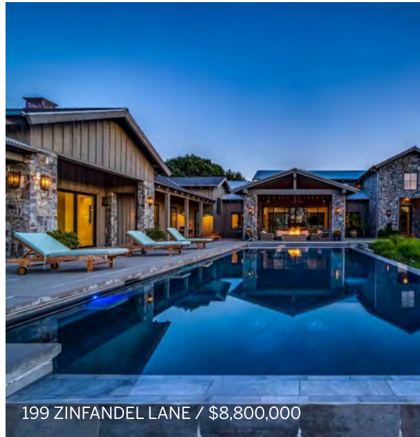
199 ZINFANDEL LANE / $8,800,000